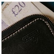
Cash, cheque, contactless

We do not get any money from any central point but from our church family, grants and hiring out our buildings