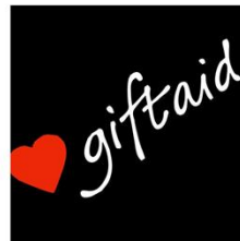
Gift Aid Declaration