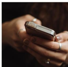
Bank Transfer or Standing Order