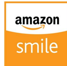
Amazon Smile 'Southcourt Baptist Church Trust'